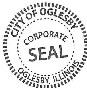
EXHIBIT A ATTACHED: Professional Services Agreement